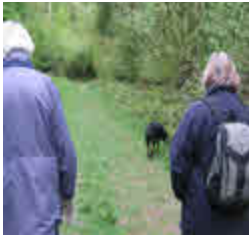
Following our leader!

There were plenty of other wild flowers along the lanes - it was hard to believe we were so close to 'civilisation'.